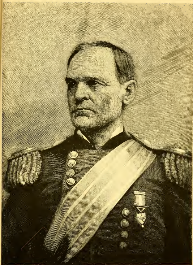
General William T. Sherman